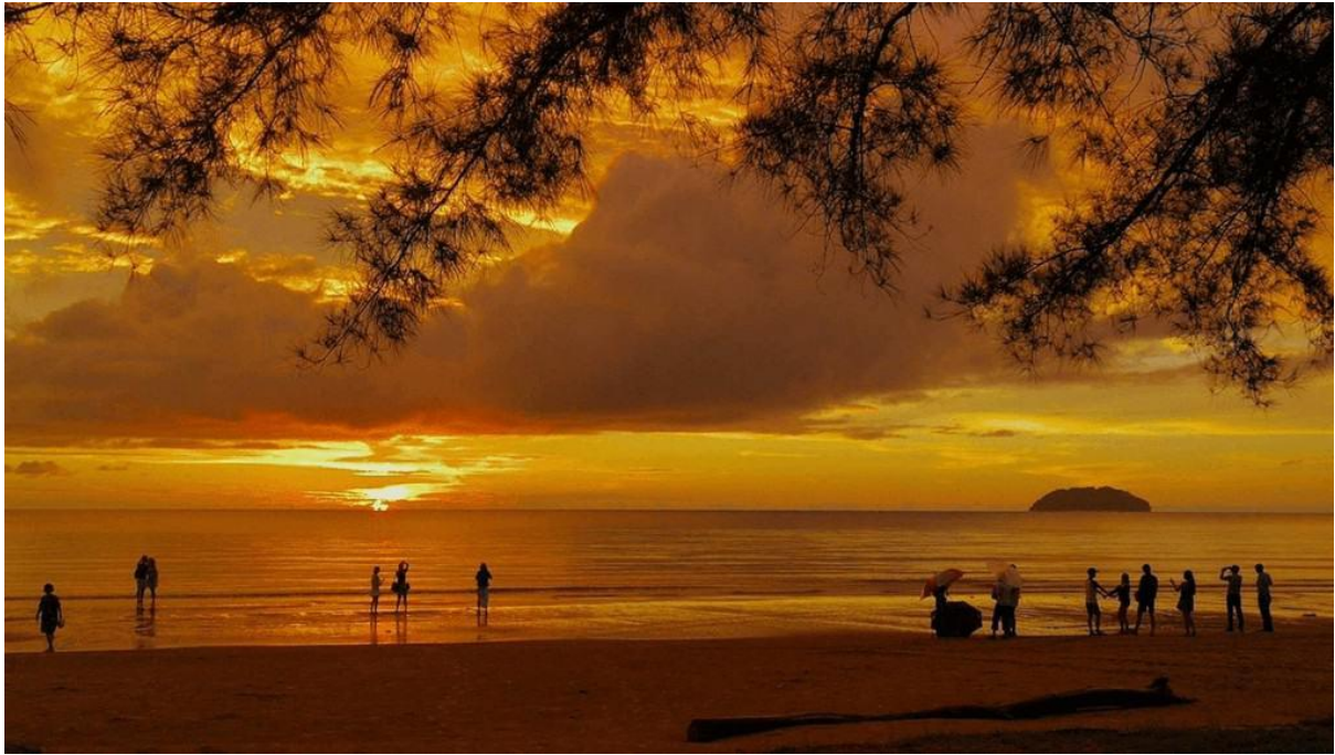
Sunset at Tanjung Aru Beach ( https://maps.app.goo.gl/qnpcnz7v6e1DPvya9 )