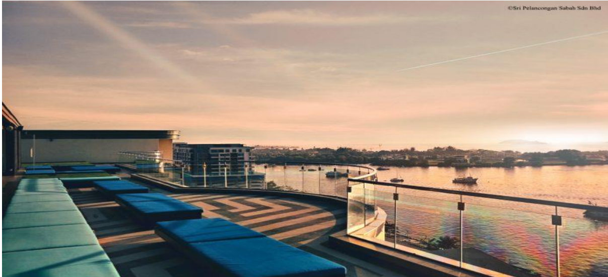
Sunset at Rooftop at Le Meridien ( https://maps.app.goo.gl/zEmk8DQwmsoPoSr4A )

Rooftop bars in the city center, such as Rooftop at Le Meridien Kota Kinabalu will provide excellent vantage points to enjoy the sunset over the cityscape.